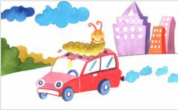
The creepy caterpillar