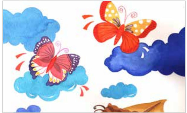
Finally, a butterfly